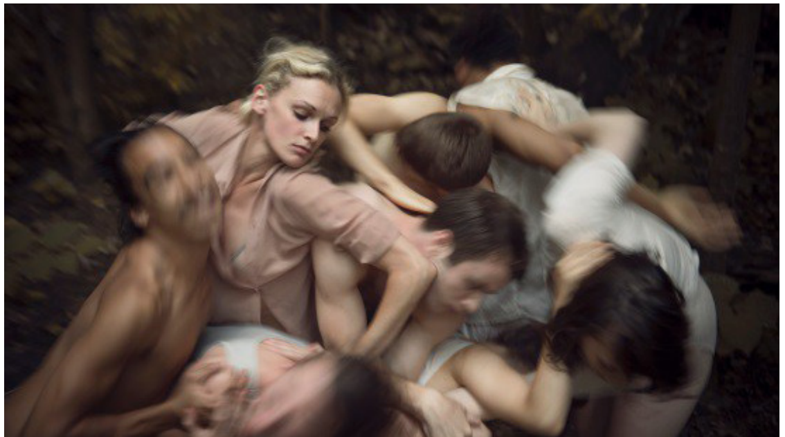
Members of Gallim Dance