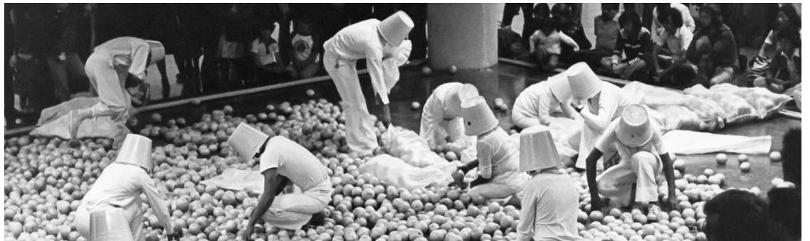
Marta Minujín – Arte agrícola en acción Toronjas 1977– Mexico City

First, the grapefruit. “Arte agrícola en acción–Toronjas” (Agricultural art in action–Grapefruit), a work originally created by the wildly creative and highly awarded Argentinian visual artist Marta