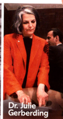
Dr. Julie Gerberding